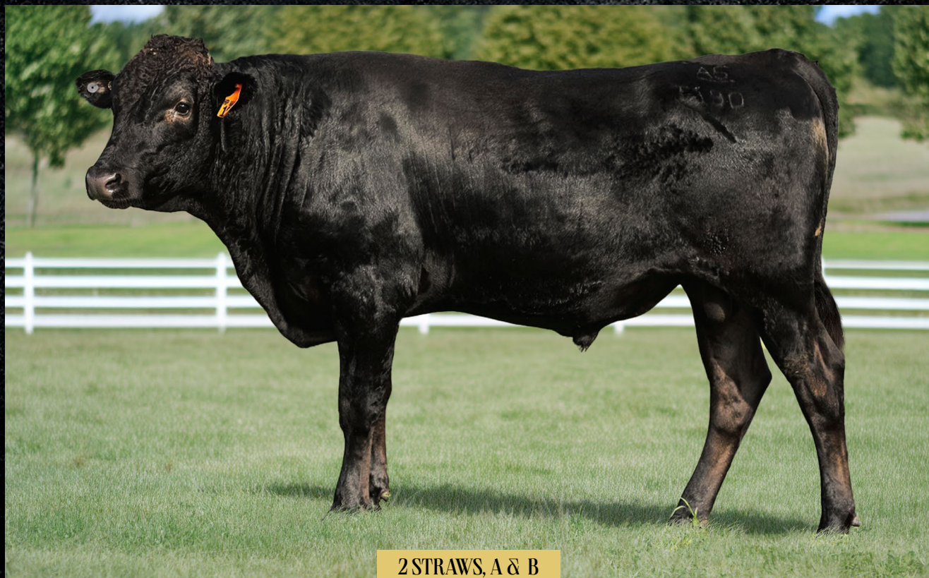
2 STRAWS, A & B

• ID HPEF22T0190 • DOB 02/01/2022 • SEX M • HEWITT PASTORAL ENTERPRISES