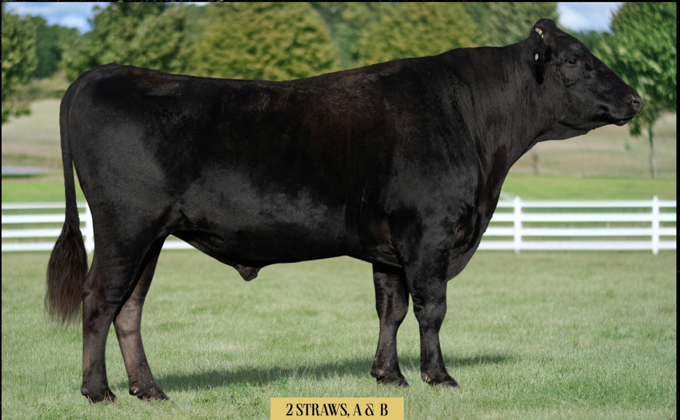
2 STRAWS, A & B

• ID BDWFQ0291 • DOB 10/06/2019 • SEX M • MACQUARIE WAGYU