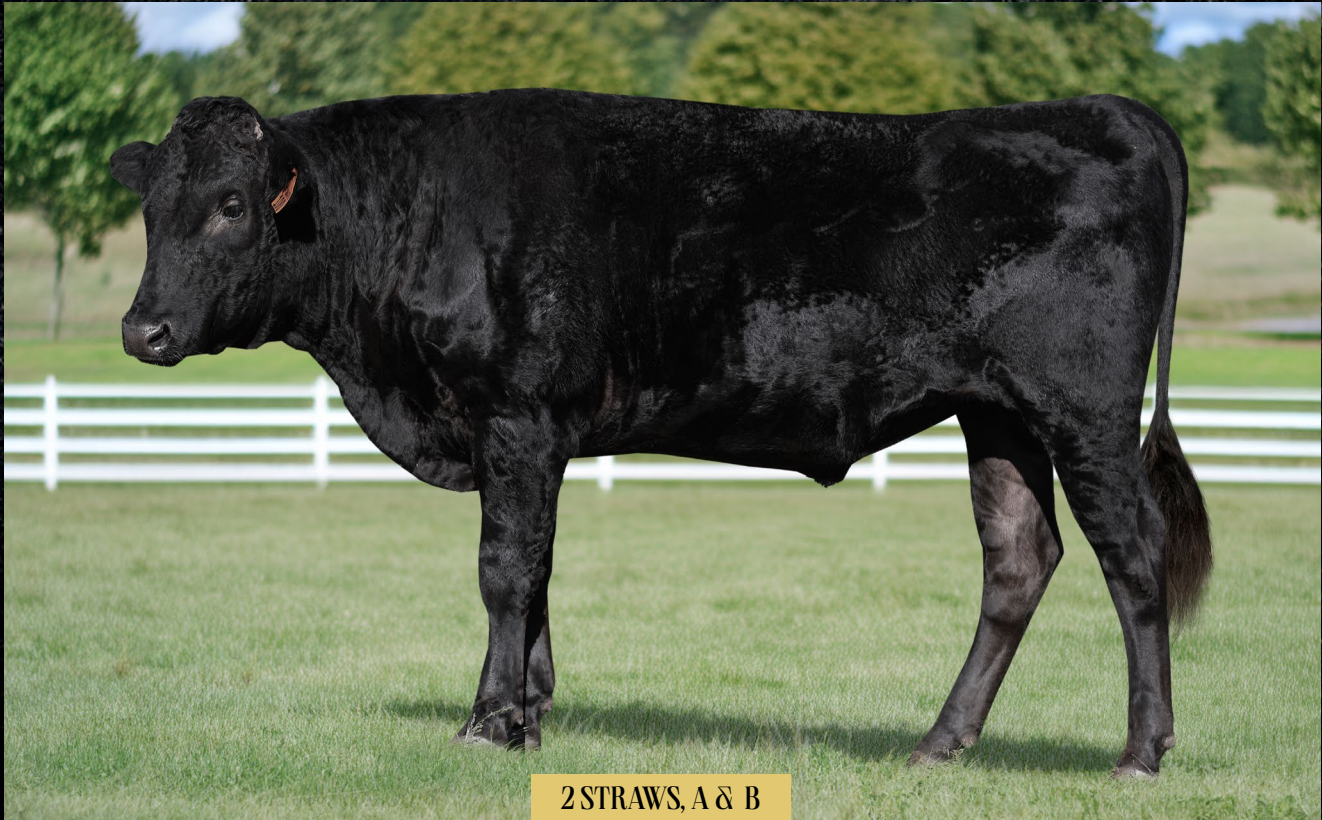
2 STRAWS, A & B

• ID HPEFP0100 • DOB 07/10/2018 • SEX M • HEWITT PASTORAL ENTERPRISES