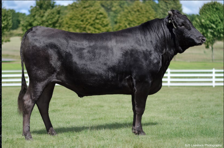
BJS Livestock Photography