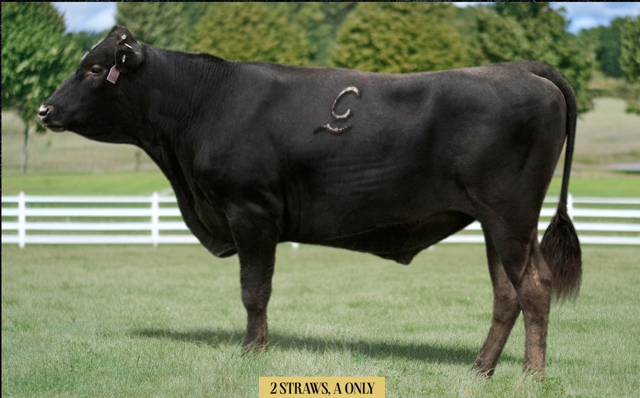
2 STRAWS, A ONLY

• ID SCRPS20J • DOB 04/03/2021 • SEX M • MACQUARIE WAGYU