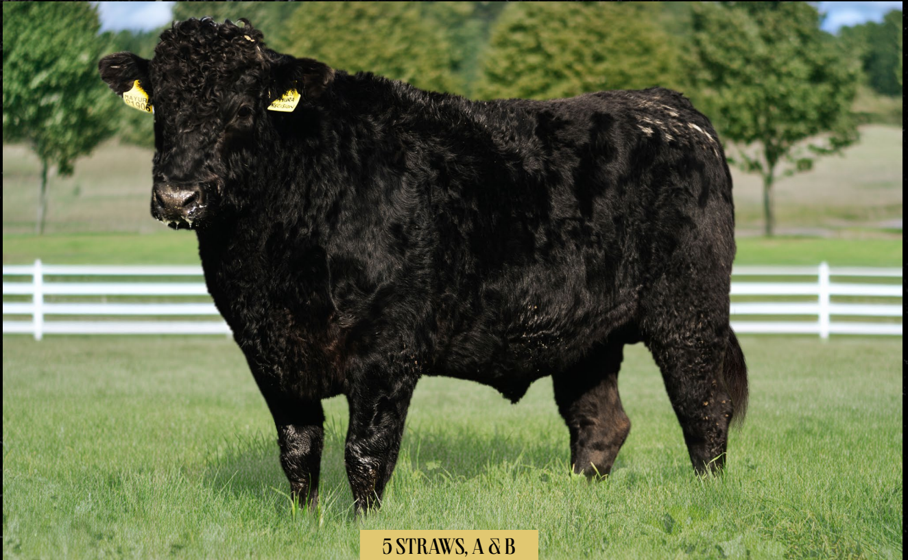
5 STRAWS, A & B

• ID ADBFP1906 • DOB 17/10/2018 • SEX M • HEWITT PASTORAL ENTERPRISES