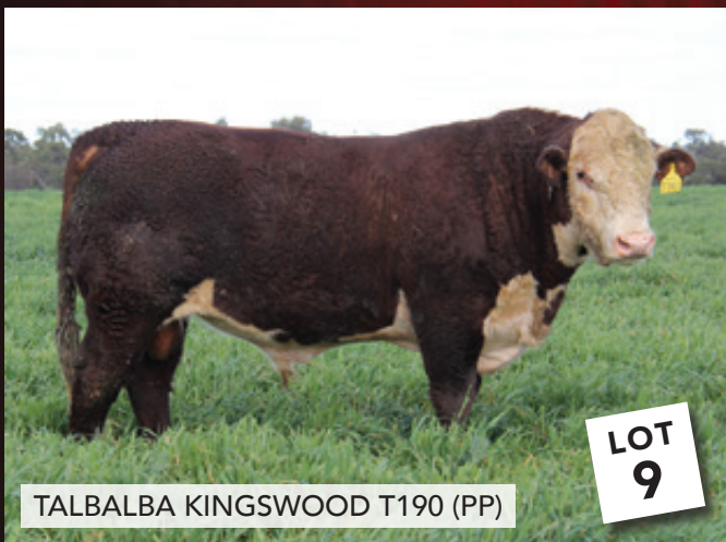
TALBALBA KINGSWOOD T190 (PP)