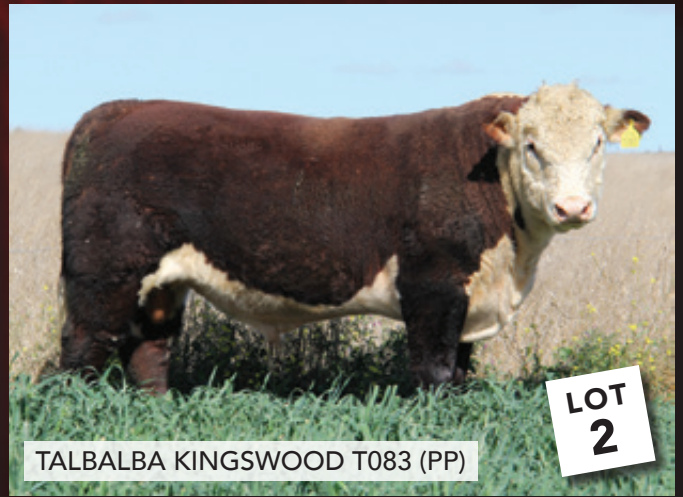
TALBALBA KINGSWOOD T083 (PP)