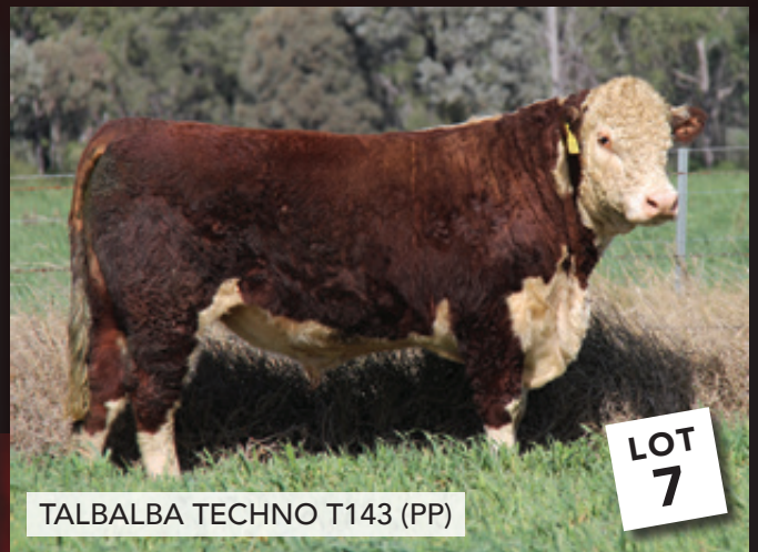
TALBALBA TECHNO T143 (PP)