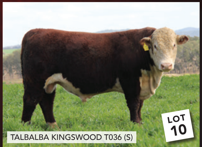
TALBALBA KINGSWOOD T036 (S)