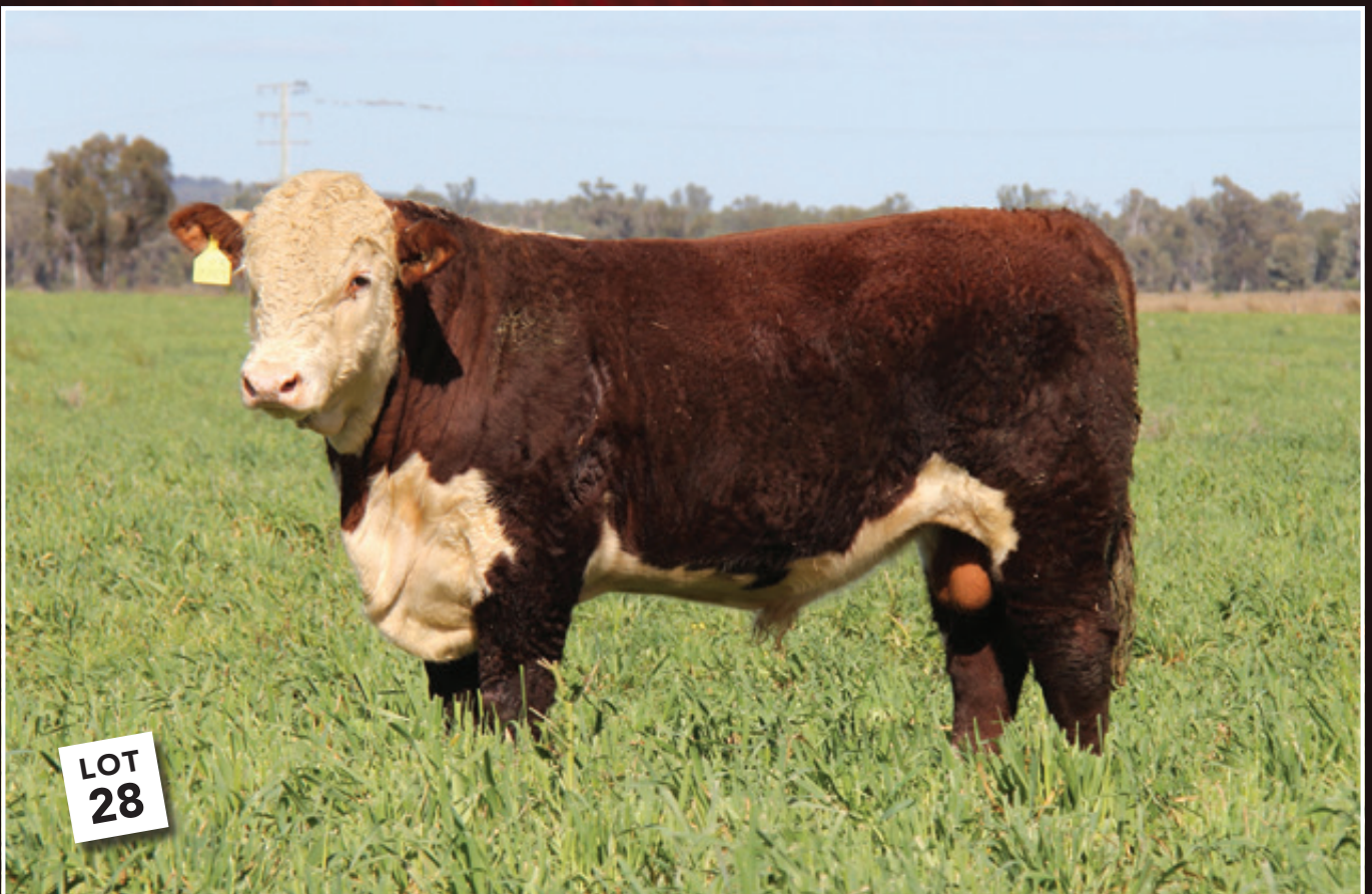
LOT 28 TALBALBA KINGSWOOD T255 (PP) AT 19 MONTHS. FULL BROTHER TO LAST YEARS TOP SELLER PICTURED ABOVE