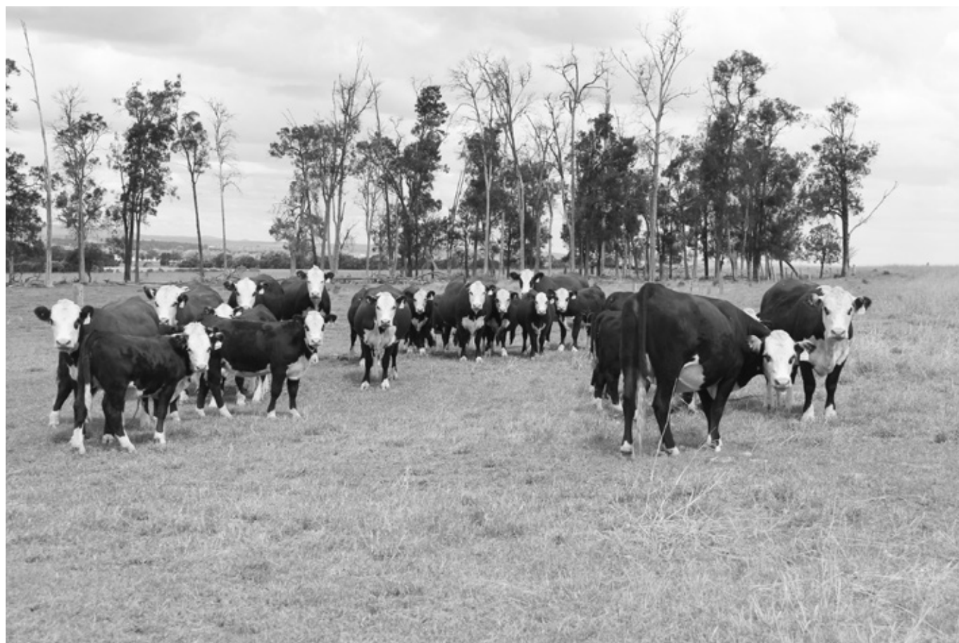
Heifers calved at 22-24 months PTIC.