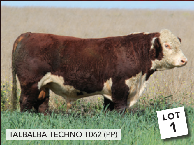
TALBALBA TECHNO T062 (PP)