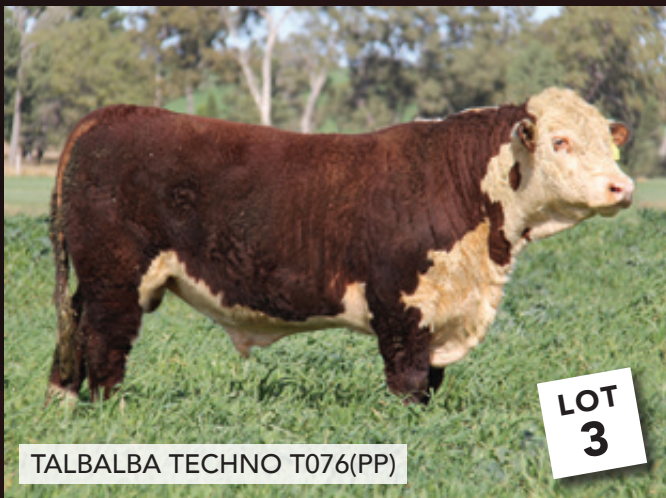
TALBALBA TECHNO T076(PP)